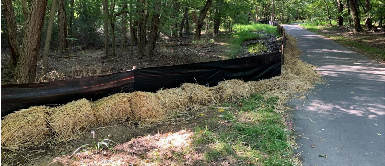
Protection for the vernal pool